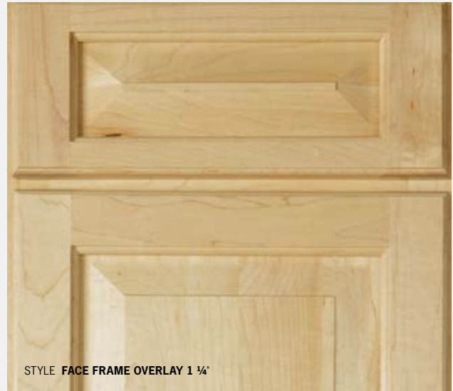
STYLE FACE FRAME OVERLAY 1 1/4"