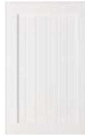
MODEL SÃO PAULO